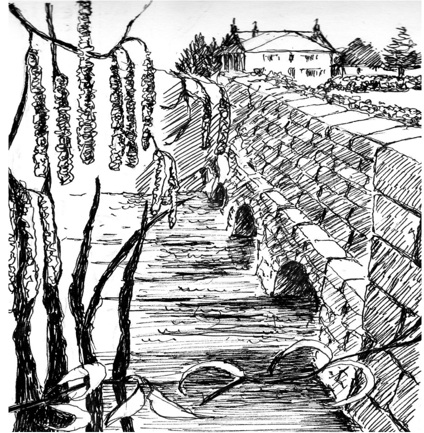
The bridge, Sand Street, Longbridge Deverill by Pat Armstrong